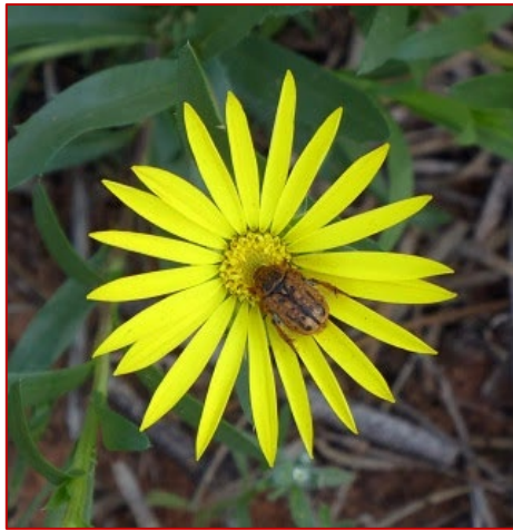
Flower-feeding scarab ( Euphoria kerni ) on golden aster ( Bradburia pilosa ) at Priscilla's ranch this month...